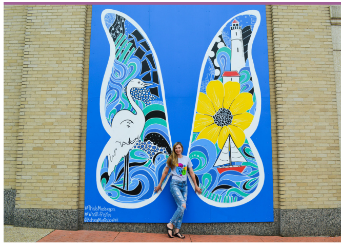
In 2019, the Festival provided 300 volunteer opportunities for the local community.